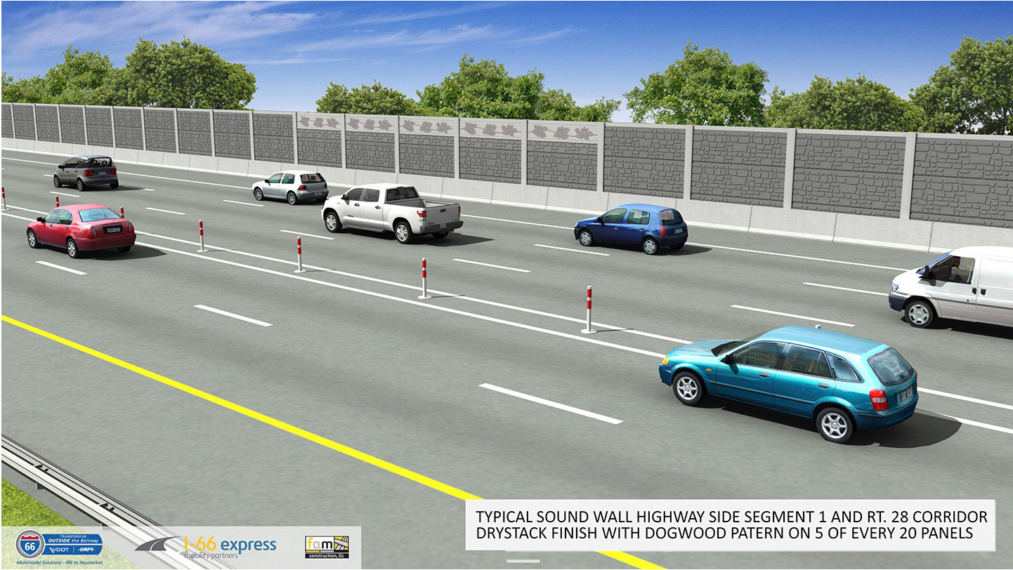
TYPICAL SOUND WALL HIGHWAY SIDE SEGMENT 1 AND RT. 28 CORRIDOR DRYSTACK FINISH WITH DOGWOOD PATERN ON 5 OF EVERY 20 PANELS